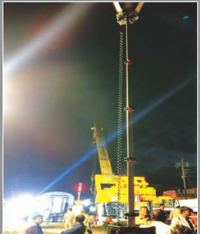
Train No. 18477 "Puri-Haridwar" KalingaUtkal Express