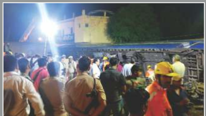
Train No. 18477 "Puri-Haridwar" KalingaUtkal Express