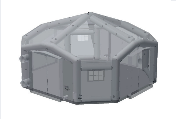
AZF CT 33