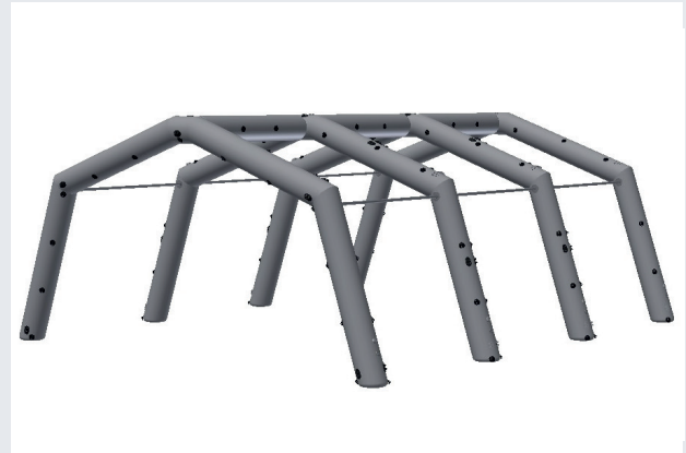
Inflatable Frame Structure AZF 6-48

Inflatable frame: Main air beams and ridge purlins are made of airtight, both-sides PVC-coated polyester fabric, weight 1100 g/m 2 .