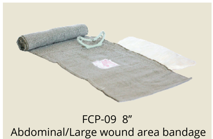
FCP-09 8" Abdominal/Large wound area bandage