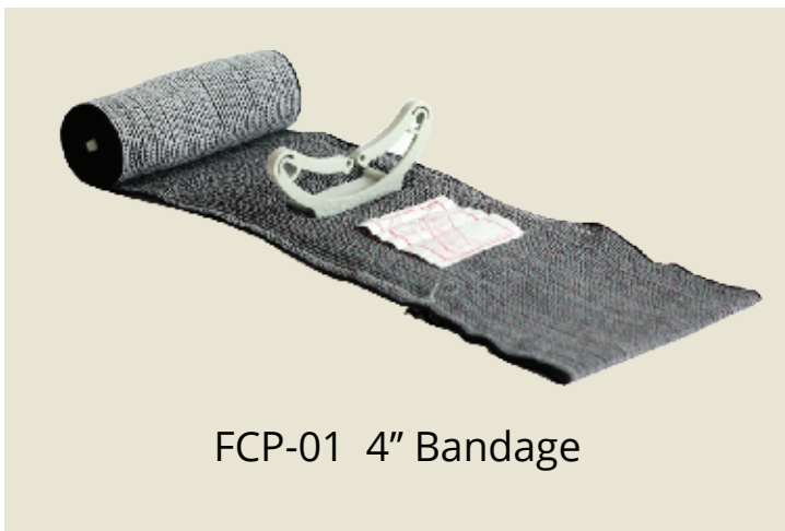
FCP-01 4" Bandage