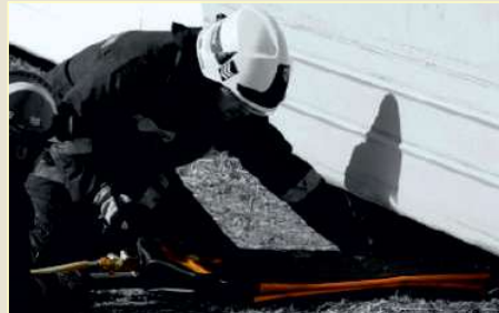
The patented insertion-nose of Lysekilen allows it to be pushed or pulled into narrow gaps