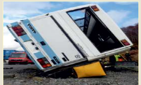
Wedge bags maintains full surface contact and lifting capacity during the entire lift