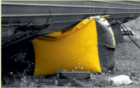
Wedge bags enables safe and efficient lifts with a minimum impact on lifted object and surroundings